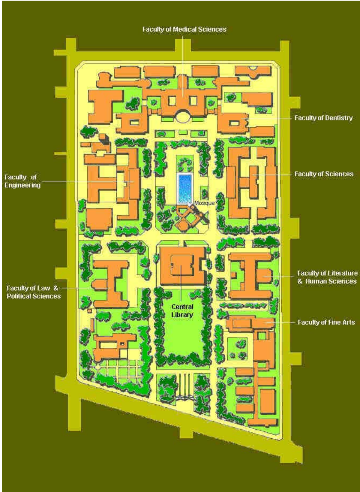
Map 2. University of Tehran Campus.

(Source: University of Tehran Website, < http://www.ut.ac.ir/utmap.htm >)